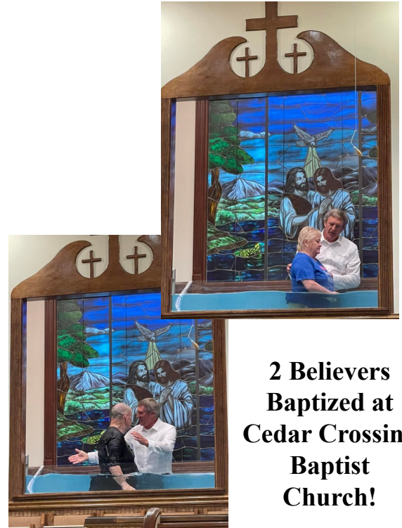
2 Believers Baptized at Cedar Crossing Baptist Church!