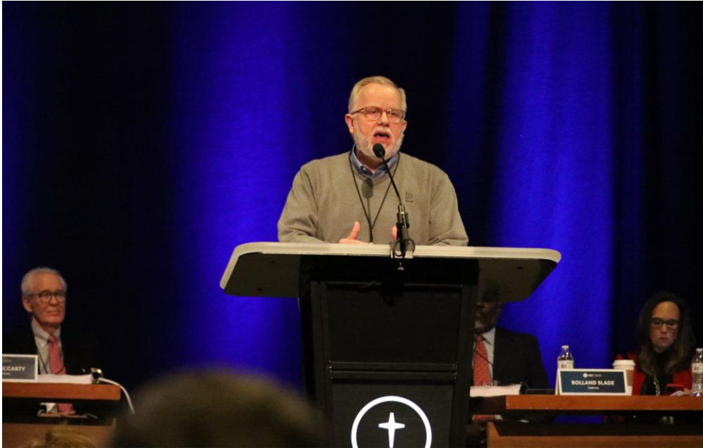
Southern Baptist Convention President Ed Litton says he won't seek a second term.