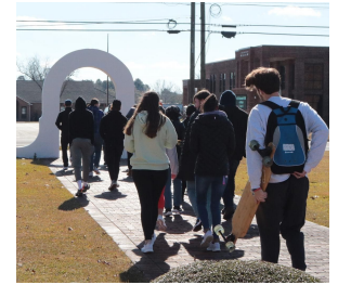
BPC - FBC Mount Vernon - Montgomery County Courthouse