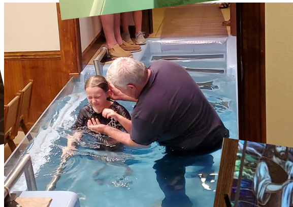
Praise the Lord! Two baptized at Cedar Crossing Baptist Church!

Hallelujah! One saved this morning at United Fellowship Baptist Church! Praise the Lord! Heaven rejoices!