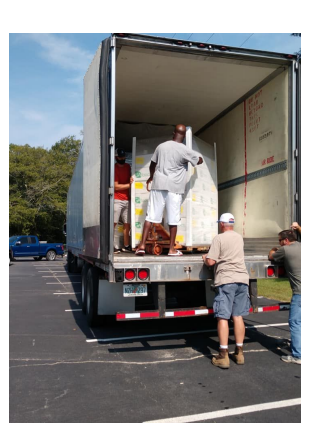
On August 18th Calvary on Aimwell shared the the Love of Christ through food distribution! Thank God for the partnership with other churches in our community!

and teachers as they get ready to go back to school!